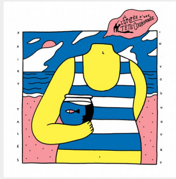
L'épopée d'une tête couronnée (Mini-LP, 2021)