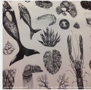
Couple of Minds / The Films and the Songs of the Seas (SP, 2019)