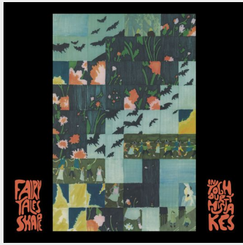
Shape Mistakes (private - LP, 2022)